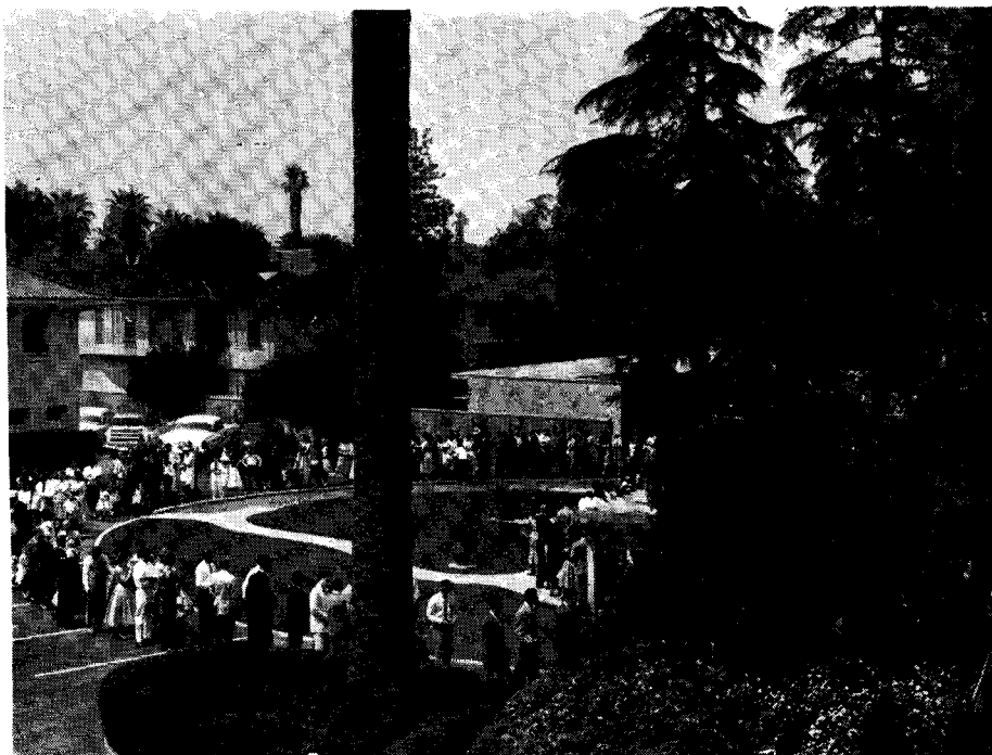
At the Headquarters Church in Pasadena, on the spacious grounds of the Ambassador College campus, nearly 1000 line up for dinner, above, and enjoy their meals on the beautifully contoured lawns, below.

We can also remember with thanksgiving that many hundreds of our brethren took the Passover in their own homes across the nation and Canada.